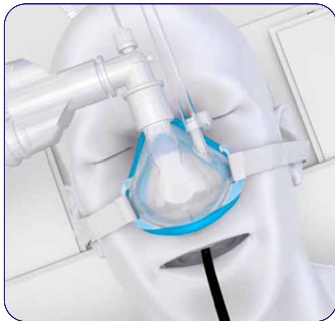
Figure 2 SuperNO 2 VA nasal CPAP device with orogastric tube in place

The SuperNO 2 VA nasal positive airway pressure mask directs the flow of gas to the upper airway, effectively stenting open the upper airway to prevent its collapse. The goal of SuperNO 2 VA is to provide oxygenation and ventilation with positive pressure to keep the airway patent. Use of this device can improve patient care for those with high-risk comorbidities by reducing the risk of hypoventilation. Notably, this device can be used anywhere there is a fresh oxygen source and may be used during transport and recovery.